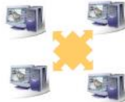
Clusters no dedicados