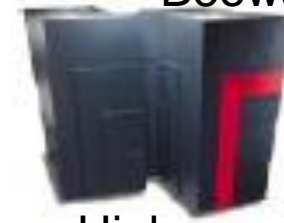
High speed networks Servidores MPP

IBM sp2, SGI Origin 2000 Beowulf clusters