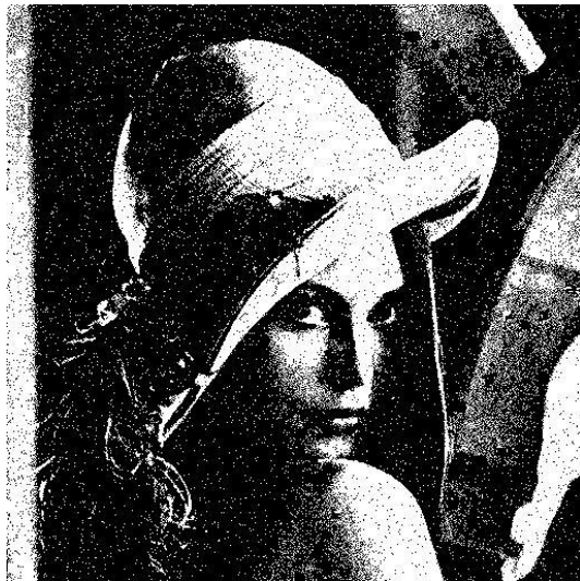
a) Imagem AP7_2