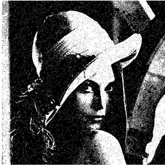
a) Imagem AP7_2