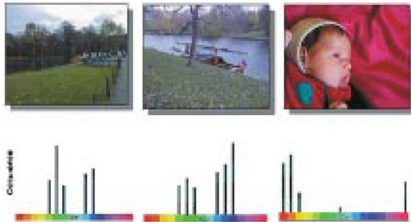
Fig. 2. Three color images and their MPEG-7 histogram color distribution, depicted using a simplified color histogram. Based on the color distribution, the two left images would be recognized as more similar compared to the one on the right.