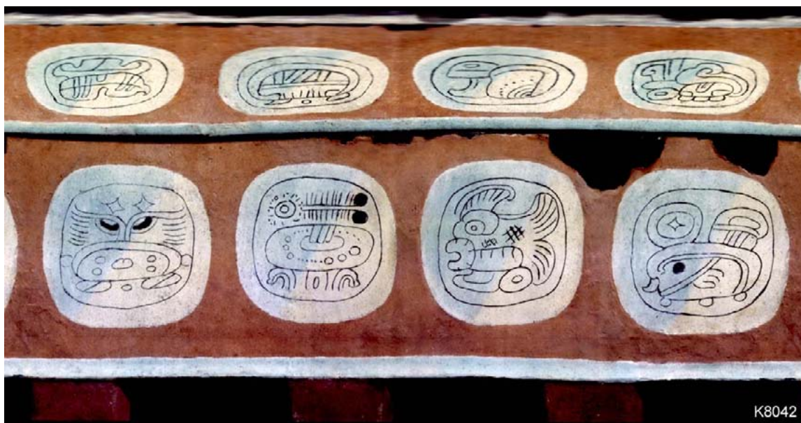
Figure 1. Na-“Gourd” Chan Ahk’s name on an early vessel (K8042).

Our knowledge of the Early Classic dynasties of most Maya kingdoms remains highly incomplete given the scarcity of epigraphic material from that period and the fact that retrospective texts are equally rare. A particularly bad case of this state of affairs is the dynasty of Naranjo, whose sequence of rulers only becomes fairly well known with the late sixth- and early seventh-century reign of “Double Comb”. 1 Martin and Grube (2000:70-71; see also Grube and Martin 2004:22-24) discuss two kings who predate “Double Comb” and for whom we have references in the inscriptions. One of these rulers, Na-“Gourd” Chan Ahk, is known only from a reference on an Early Classic ceramic vessel (Figure 1). This individual is assumed to be a Naranjo king since he carries the elite title saak churwe’n , 2 usually associated with royal individuals of that site.