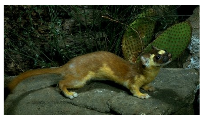
Figure 11: The Long-Tailed Weasel

This would be a plausible match for the animal head visible on these examples, apparently that of a small mammal.