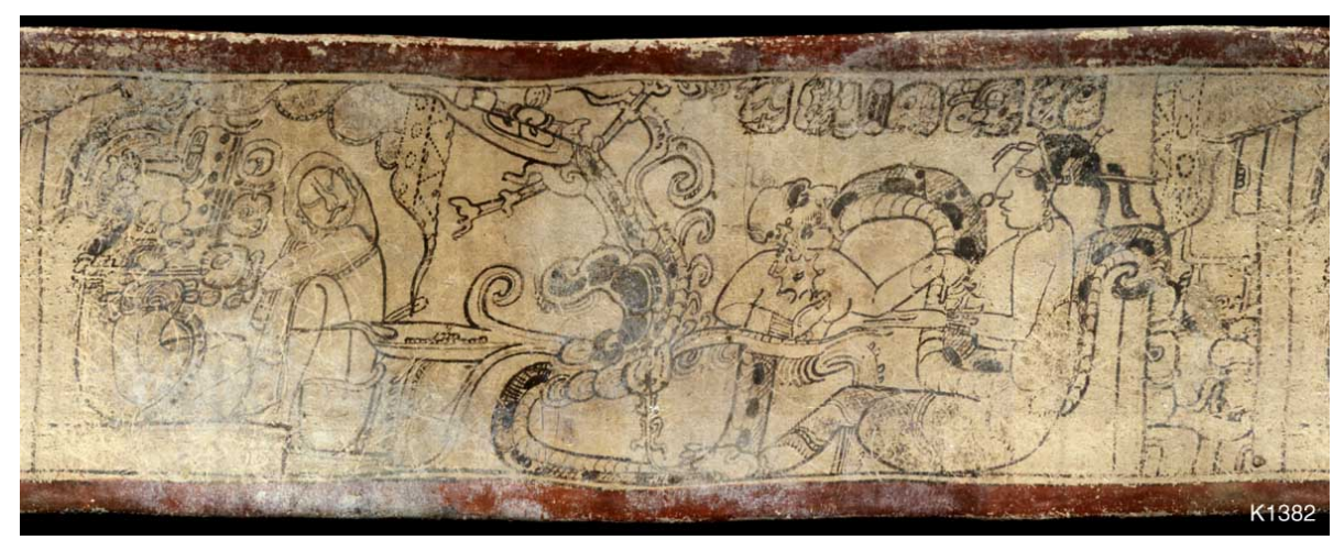
Figure 8: K1382.

If we assume that the T790 collocation in K5164 is in fact part of the name of the God N being born then the interpretation of the name of the lady as "lady who conjures, snake winder" must be revised. Indeed, if the kotz' root is the correct reading, the "wound up thing" must be the newly born God N and not the snake.