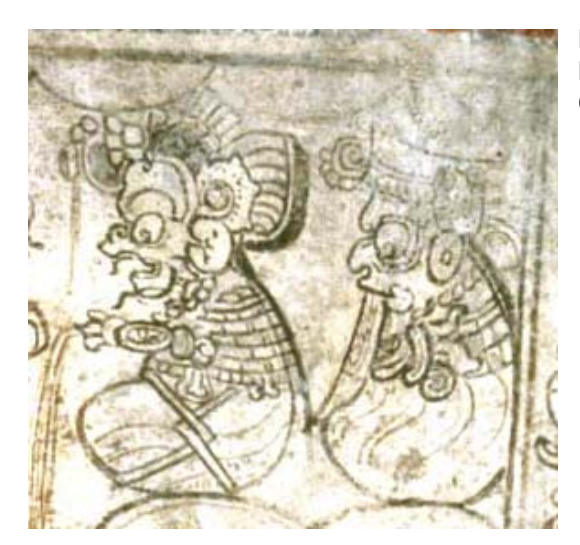
Figure 12: Detail from K1081: baby Chaahk and Pax God wrapped in bundles witness the birth of God N.

Finally, there is the question of the interpretation of the name of the "Snake Lady". On the scenes associated with this myth, other gods often appear in bundles and their births are mentioned in the accompanying texts. A particularly good example is that of K1813, where the names of several gods, including the bundled Chaahk and perhaps the Pax God appear in a list of born deities. A possible interpretation is that this "winding" or "wrapping" refers to the act of taking the newly born God N and wrapping it in a bundle, like a baby (Fig. 12). Indeed, Moran (1935) gives the following entry for kotz' – "wrap up in leaves, roll up in leaves" which conceivably may be extended semantically to "making a bundle". Another possibility is that this "winding, wrapping" refers to the act of taking the baby God N in her arms, winding her arms around him.