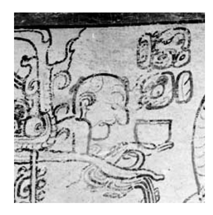
Figure 4: Detail of the Old God on K2067

The text is essentially a compact version of the one found on K5164 and seems to be composed mostly of name tags. The most interesting information here comes from the name tag for the old god emerging from the snake's mouth (Fig. 4). The text may be transcribed as follows: