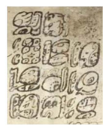
Figure 6: Detail of the old god on K2067

The main text (Fig. 6) may be transcribed as follows: