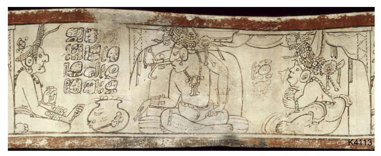
Figure 5: K4113.