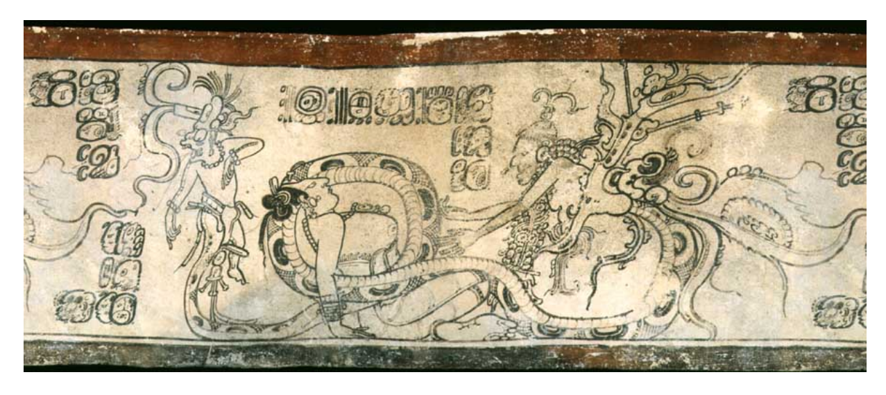
Figure 1: K5164 (photo by Justin Kerr).

Paradigmatic among these scenes, and perhaps the most exquisitely executed, is that on vessel K5164 of Justin Kerr's Maya Vase Database (Kerr n.d.) (Fig. 1).