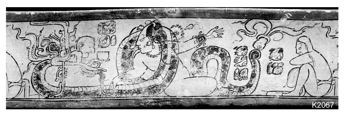
Figure 3: Kerr 2067.

The first clue to the identity of this glyph comes from another vessel depicting the same mythical episode, K2067 (Fig. 3).