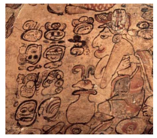
Figure 10: Detail of K530

From the above discussion, the deity named at position [4] in both K5164 and K1382 must represent the form of the God N emerging from the mouth of the snake.