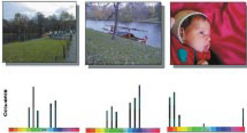
Fig. 2. Three color images and their MPEG-7 histogram color distribution, depicted using a simplified color histogram. Based on the color distribution, the two left images would be recognized as more similar compared to the one on the right.